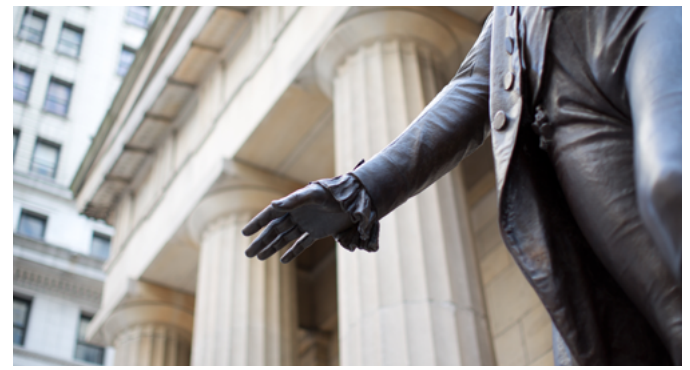
Our five predictions for the next five years and beyond